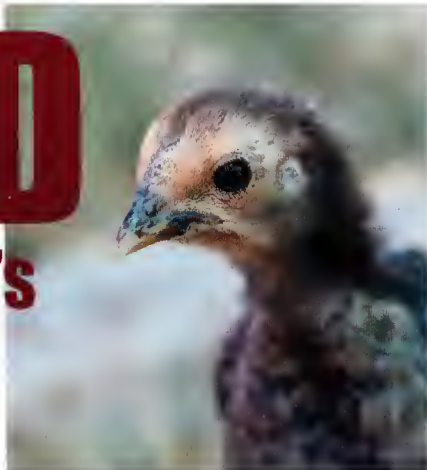
Baby chicks may look cute, but they can pose a health concern.