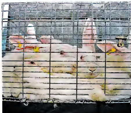
Rabbits like these were being raised for slaughter in an apartment.

When a neighbor heard the screams, she panicked thinking a child had been injured. She raced to her backyard and looked frantically for the source of the blood-curdling cry. Peering over the fence, she was horrified to find a man restraining a piglet, blade raised to cut her neck. For months, she had snuck the piglet treats, fascinated by the idea of having a farm animal in her urban neighborhood. Before she could protest, the piglet lay dying on the lawn, her blood staining the grass red...the color of urban animal farming.